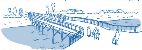
The first "Kaion Bridge" and the surrounding scenery